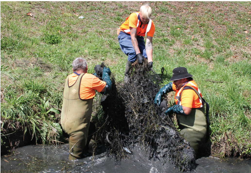
Our crew removes a tangle of mattress springs during their clean-up of Omaru Creek in Glen Innes.